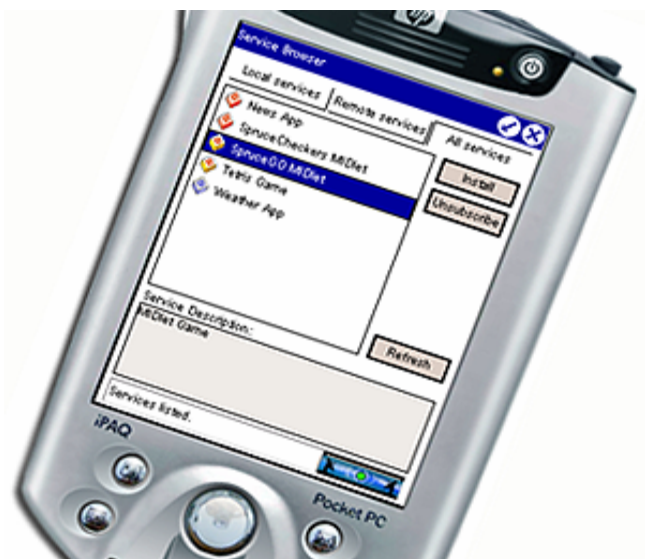
The Service Browser Overview

mGUI-based application, which appears in the start menu of the PDA operating system and enables users to subscribe or unsubscribe to services published on the backend. It also allows installing and uninstalling services on the underlying OSGi Framework.