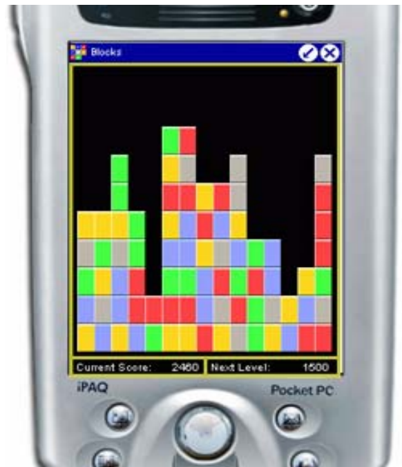
The popular Blocks game

Additional capabilities and packages of mBedded Server and other ProSyst products are explained in the data sheets available for each product.